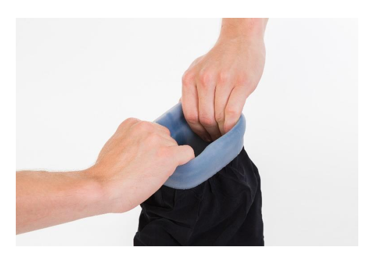
Step 2: Place the knee sleeve on the prosthesis edge and roll the inside-out half downward, over the socket.

The Symphonie Aqua Knee Sleeve comes with an integrated edge protection function which must be cut to fit the individual form of the socket edge. Push the lower half of the knee sleeve outward, to expose the inner side.