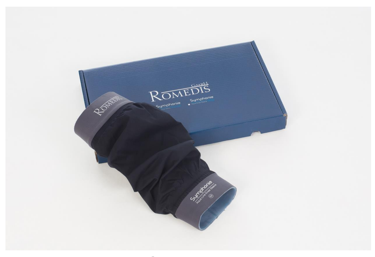
SA 801 1-4